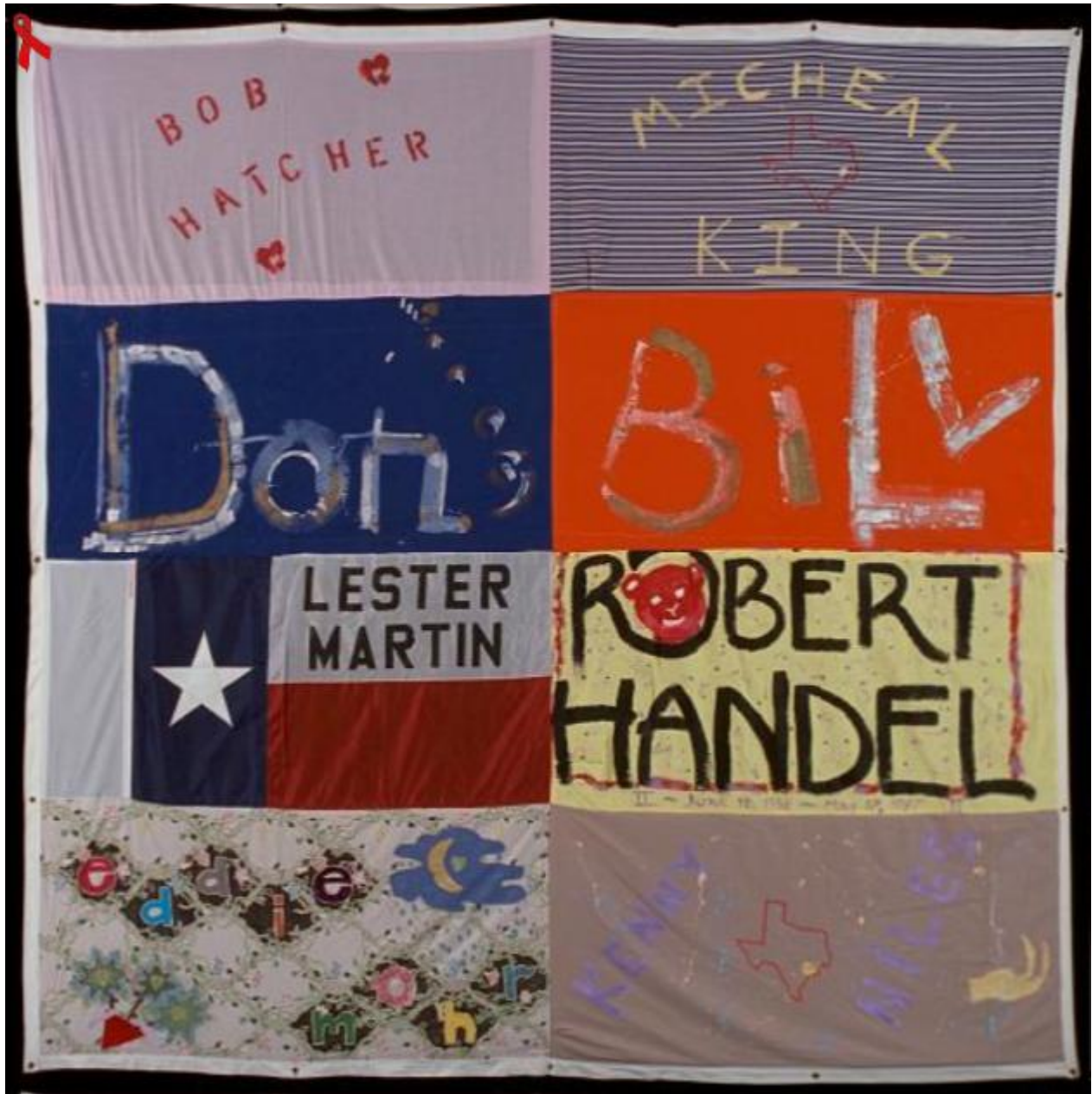
Names on Block #119